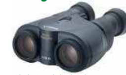
Image Stabilized Canon Binoculars

Digital image stabilization makes it easy to track and clearly view those elusive rainforest birds. A wide range of magnifications and fields of view available. If you're going to go all that way you might as well see what you came to see...